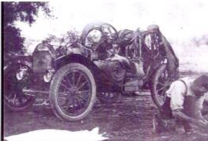
Sid frying eggs for breakfast

During his time at the Canada Cycle and Motor Co he was approached by management who had an interest in importing and marketing the Brush motor car in Australia to test drive and evaluate the Brush motor car's suitability for Australian conditions. A major test of the car's durability was required and a plan hatched to be the first to cross Australia from west to east. Sid was asked if he was up to the task to drive this vehicle all that distance in very unsuitable terrain. He would be equipped with all the necessary food and fuel and he would be accompanied by a navigator called Francis Birtles.