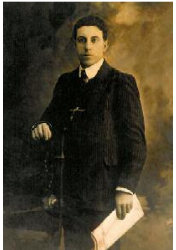
A handsome young Aussie.

We understand he was asked during the interview if he knew how to operate a lathe and other associated machinery and had a good knowledge of mechanics.